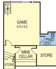
LOWER GROUND FLOOR

NOTE: Every precaution has been taken to verify the accuracy of the above details. However, prospective purchasers are advised to make their own enquiries. Fletchers gives no warranty to the above and expressly disclaims all liability for any loss or damage, whatever the cause which may arise from any person acting on any such statements.